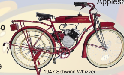
1947 Schwinn Whizzer